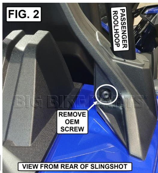
VIEW FROM REAR OF SLINGSHOT